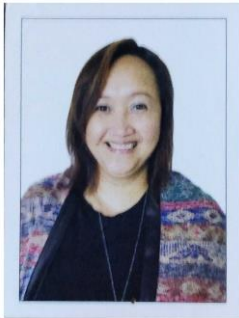
PhotoScan by Google Photos